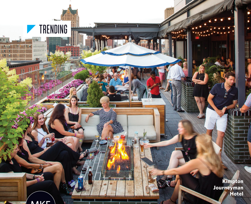
Kimpton Journeyman Hotel